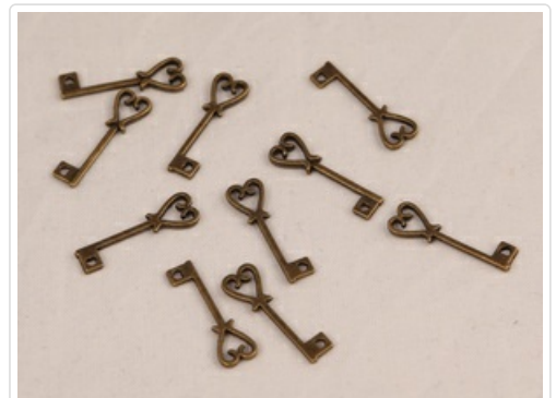
Researchers have been looking for other drugs that can act as a

Unfortunately, it's not quite that simple. Like many drugs, when taken orally, not a lot of BDNF makes its way to the patient's brain. Perhaps more importantly, since BDNF is a key that binds to more than one key-hole or receptor, we need to be careful about which signals are activated. To get around these limitations, researchers have been looking for other drugs that can act as a set of spare keys to unlock the