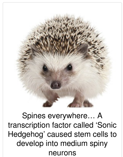
Spines everywhere... A transcription factor called 'Sonic Hedgehog' caused stem cells to develop into medium spiny neurons

In their recent work, Zhang's group used Quinolinic acid to mimic the cell loss in Huntington's Disease, and then replaced the lost cells by injecting the medium spiny neuron-like cells they generated from human embryonic stem cells.