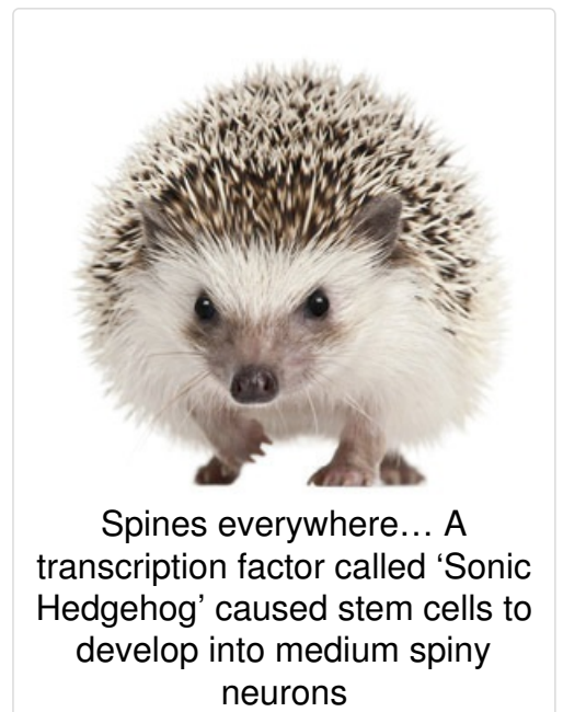
Spines everywhere... A transcription factor called 'Sonic Hedgehog' caused stem cells to develop into medium spiny neurons

In their recent work, Zhang's group used Quinolinic acid to mimic the cell loss in Huntington's Disease, and then replaced the lost cells by injecting the medium spiny neuron-like cells they generated from human embryonic stem cells.