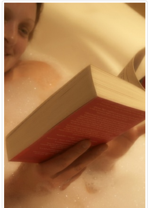
Establish a 'pre-sleep ritual',