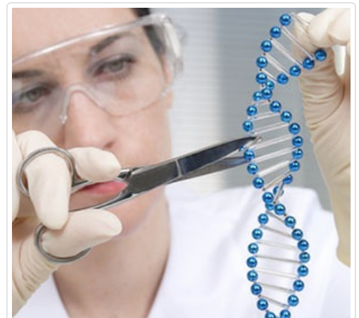
Scientists can now 'edit' the DNA of cells, repairing genetic errors.

Techniques to achieve feats like this have advanced in recent years, and it's now possible to perform precision 'genetic surgery' in a test tube - but challenges remain, like the complex genetic manipulations needed to achieve a desired change, the luck of the draw in removing the mutation correctly, and the risk that genetic 'tools' left behind might cause harm.