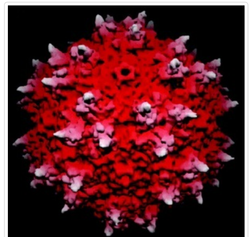
Adeno-associated virus type 2, the virus used to deliver genes to

The neurosurgeons involved with the study then injected this 'genetically engineered' virus into the basal ganglia of patients with advanced Parkinson's Disease. As a 'control',