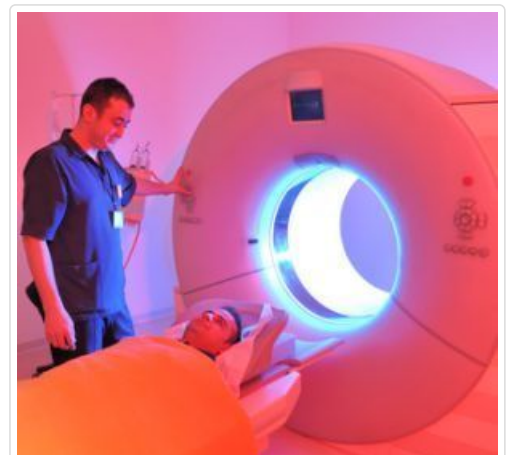
MRI scanning produces detailed images of the brain

Scientists have been surprised by how early in life it's possible to find brain changes in people with the HD mutation. In a particularly vulnerable region of the brain called the striatum, HD mutation carriers show shrinkage as long as 15 years before they'd be predicted to have symptoms of HD. But how early do these changes begin?