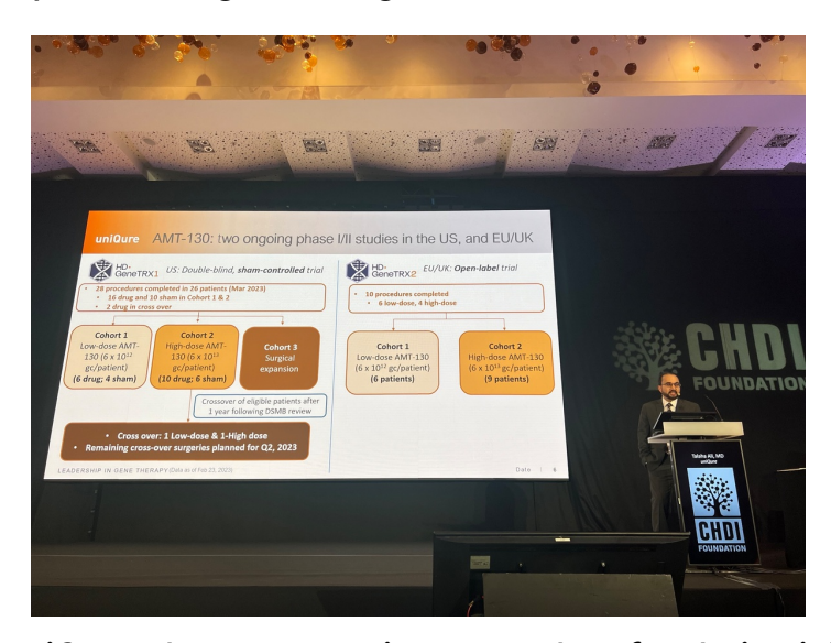
Dr. Talaha Ali from uniQure shows a recruitment update for their trials testing AMT-130.

While branaplam was safe in children with another disease (spinal muscular atrophy), some animal studies had indicated there was a possibility of damage in the nerves that project from the brain to the skin and muscles of the body. Based on that concern, Novartis included specialized experts in that kind of nerve damage amongst treated HD patients, just in case such a symptom emerged during the trial.