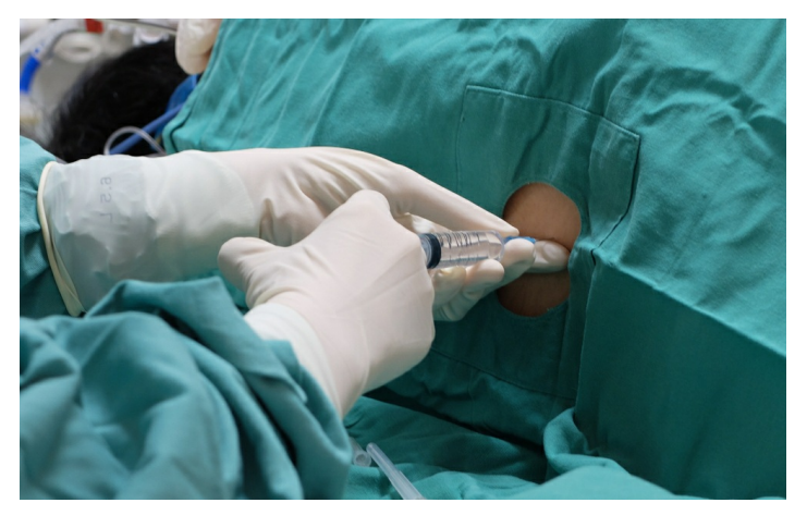
Neurologists and other doctors routinely access the spinal fluid through very fine needles near the base of the spine

Today we received an interesting letter from Roche, with an updated plan for the GENERATION HD1 study. The letter describes some surprising changes to the study, which could sound concerning, but we think are actually really exciting.