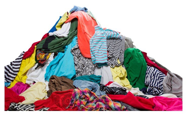
You can choose to leave your sheets in a big jumble, but proteins need proper folding into the correct 3D shapes to function optimally

So how can a mutant protein spread between cells like an infection? The answer may lie in tiny messenger compartments called exosomes. These are structures that help neighboring cells communicate by sharing chemicals and proteins. Cells are encased in membranes, curved fatty barriers against the outside, like a big bubble. The membrane can pinch off a teeny tiny portion of itself to form a new little bubble, packed with cargo it wants to send to a cell down the lane. The little bubble merges with a new cell, and pop! The contents are now inside that cell.