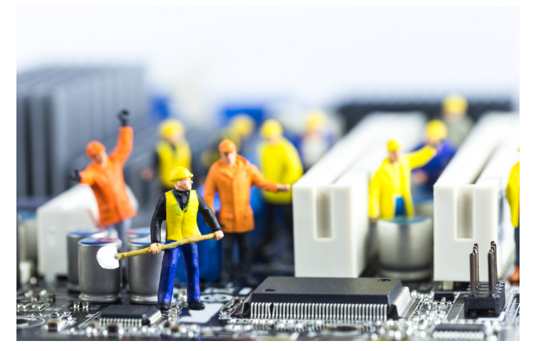
Several of the genes identified are involved in repairing and maintaining our DNA - a possible clue to how they may influence the age of HD onset.

At the end of this massive, multi-year, effort, the researchers found just what they were looking for. Differences in at least two, and likely three, regions of DNA were firmly linked with an earlier or later onset of Huntington's disease.