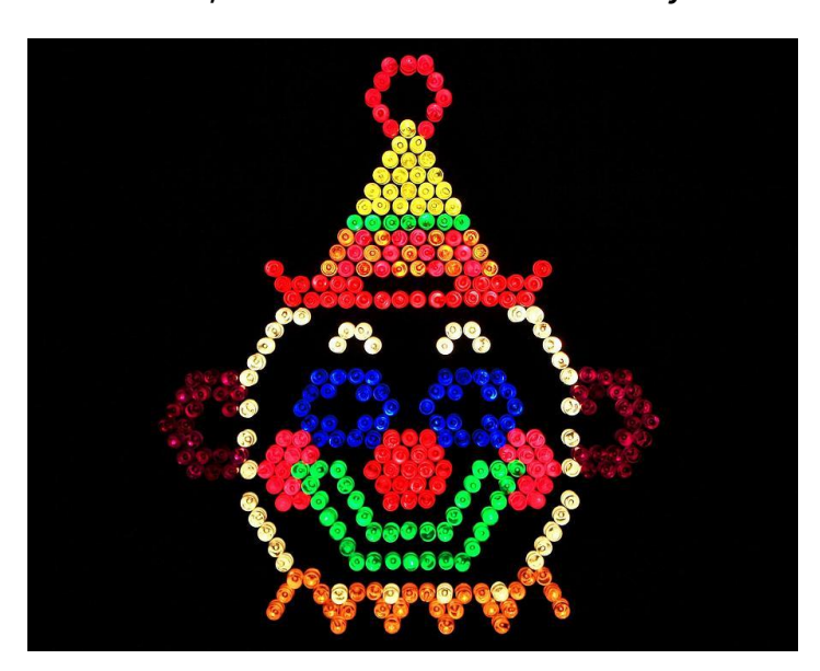
Much like the nostalgic Lite-Brite toy, illuminating a subset of neurons and leaving the rest dark allows a picture to emerge

The researchers weren't content to study only changes in the striatum, however, they looked widely at other brain regions in hopes of identifying other early changes in the HD brain. Surprisingly, the region with the most axonal swelling was a structure near the striatum called the stria terminalis , which is involved in anxiety-related behavior.